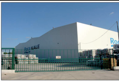
Rack Clad Building