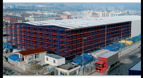
Steel construction for strong building Coldroom & logistic warehouse